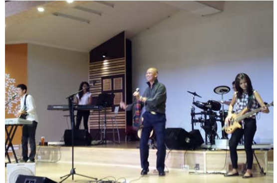
"You ain't nothing but a hound dog!"