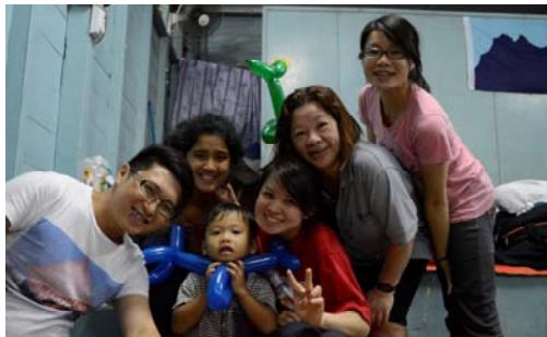
Befriending the local youth