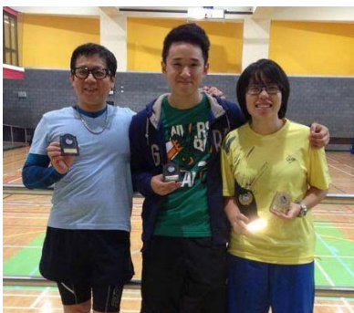
Our deserving medallists!

When NLCC was first invited to participate in the WA Inter-Denominational Badminton Competition on Saturday 29 March, the response was lukewarm and there was an initial apprehension that we would not be able to make up the numbers. However, the players started coming out of the woodwork and lo and behold, NLCC managed to field a more-than-competitive team!