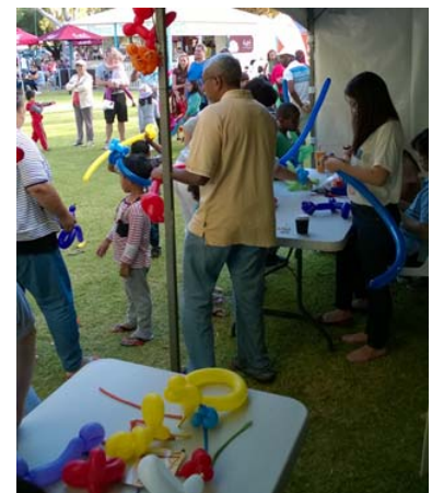
Balloon sculpting in action

Truly there was never a dull moment; if you weren't busy with balloons, your attention would have been cast upon the stage. With such awesome things going on, who wouldn't want to drop by each year to help out and experience the things planned for the day? I definitely will consider going once more and hope to see you next year too! ■