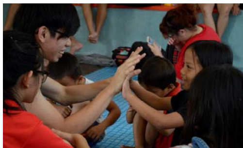
Spending time with the Timpangoh children