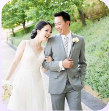
1 John 4:4 "We love because He first loved us."