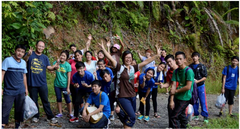
Sabah Missions Impact Trip: 13-23 December 2013

This missions trip may be my first but it will most definitely not be my last. There were so many memorable experiences such as trying to induct an autistic boy into the group, trying to cross a mountain and bathing in the river. What a baptism. ■