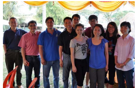
Happy to be serving the community