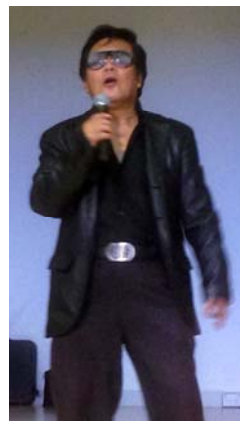
Rocking for Jesus!