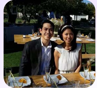
1 John 4:12 "If we love one another, God lives in us and his love is made complete in us."