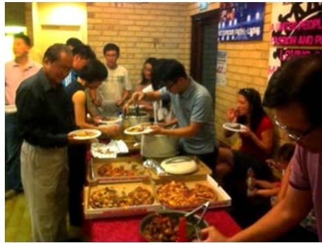
Another fine NLCC lunch spread!

While bricks and concrete may physically make up a church, its heart and soul is founded in its congregation. NLCC is blessed to have faithful, Christ-centred believers who are ever willing to invest in the prospect of seeing the extension of God's Kingdom here on earth.