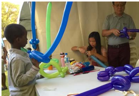
Balloon swords were very popular!

It was a wonderful day and great fun for all. The children were definitely eager for their own balloons as evidenced by the swarm that only grew larger within minutes of arriving.