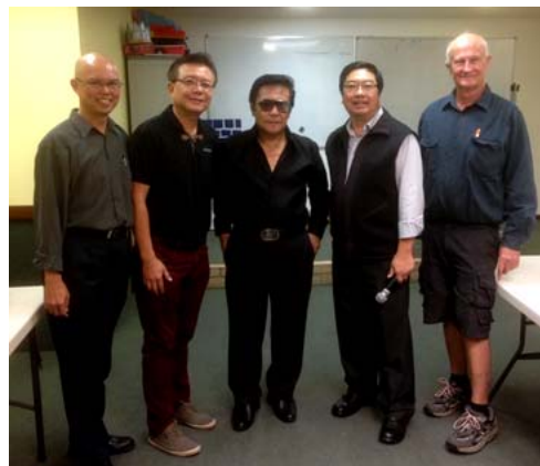
HT Long at NLCC

HT's performance and testimony was a great encouragement that we can actually use the secular things of the world to bless people, and to take the opportunity to spread the gospel. What a powerful testimony!