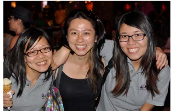
Wonderful fellowship amongst the team

After 10 days and with a heavy heart, we said goodbye to Siem Reap. We trust that it is only a momentary farewell and some of us will be returning, perhaps heading to a different region of Cambodia. Will you come and be part of the upcoming team for an exciting journey? ■