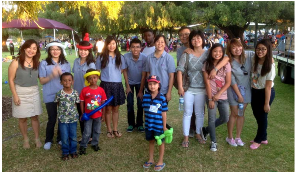
Belmont Harmony Day volunteers with happy kids

Many different sculptures were created and given to the excited children, most of whom asked for the good old-fashioned swords, flowers, parrots and four-legged animals. This year, the animals were brought to life by the cute drawn-on faces! Others, however, preferred something unique created just for them and asked for shields, aeroplanes, penguins and even a lovely heart shape. It was an indicator for us to learn some new creations to add to our arsenal so that we could bring a smile upon every face. Other