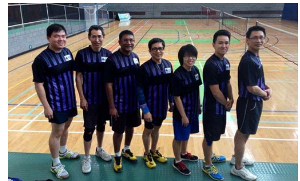
NLCC's badminton team

NLCC came in third overall which is a great effort as we did not field any juniors at all. To cap it all off, the organiser called the next day to congratulate us on our efforts,