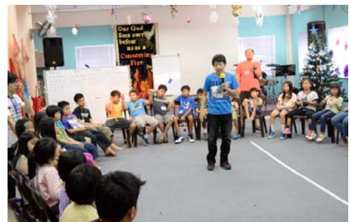
Fun and games at the children's camp