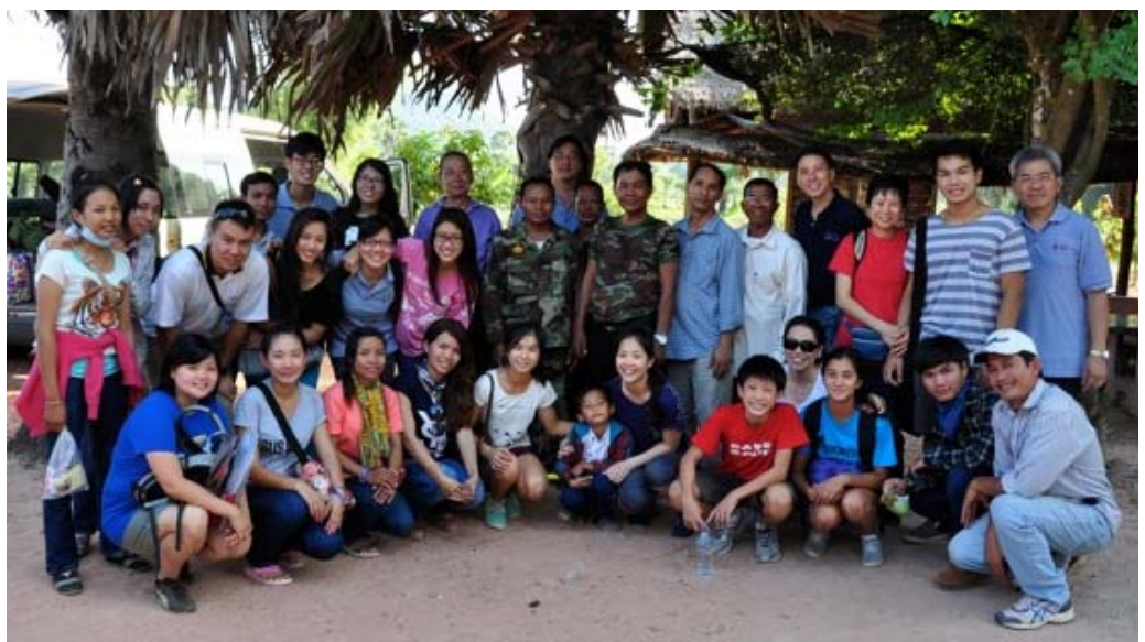
Cambodia Missions Impact Trip: 26 December 2013 to 5 January 2014.