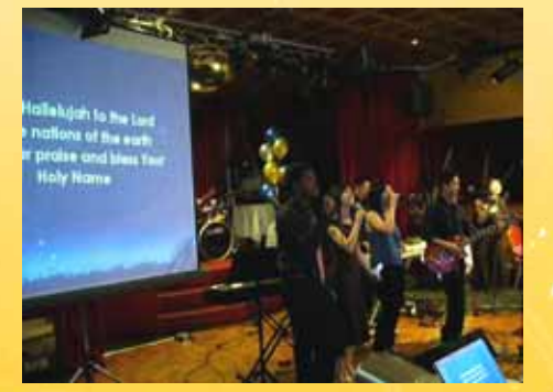
The Worship Team performs an original song

Not only was it an evening of nostalgia, reflecting on days gone by, but also a night where new milestones were made. As people arrived, they were distributed copies of the very first edition of NLCC Epistles , hot off the press. (If you're reading this now, then good on you!)