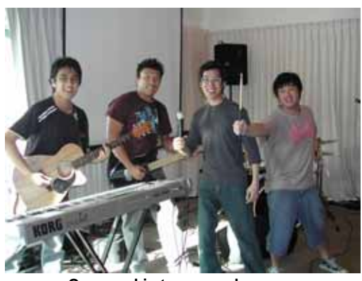
Our worship team members are more than conquerors!

<sup>5</sup> Philippians 2:13. <sup>6</sup> Psalm 1:1. <sup>7</sup> Ephesians 2:4-5. <sup>8</sup> Ephesians 1:18-20.