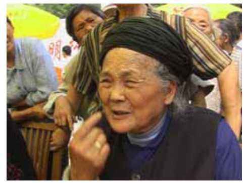
One of the more expressive patients

The second instance involved a man who had a motor vehicle accident and sustained a most disfiguring injury. He was in the intensive care unit for the