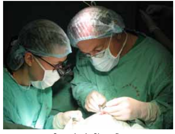
Surgeries in Cheng Du

The first day was spent meeting government officials, head of departments and other VIPs. Anything "international" in China is heavily overstated and publicly made aware of – for instance, we were greeted in one city with banners, marching bands(!), a salute by dancing